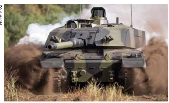
The assessment phase of the British Army's CHALLENGER 2 LEP programme has concluded and is being considered for a main investment decision before the end of 2021.